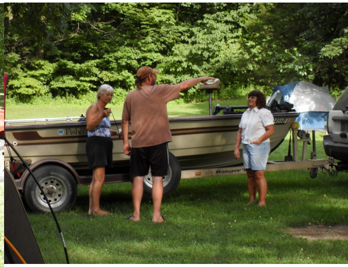
They went that-a-way!