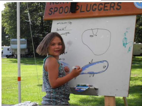
McKenzie drawing a structure situation?

“KNOWLEDGE IS THE KEY TO FISHING SUCCESS ”